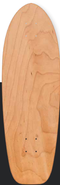
MB410 9.5" x 29"