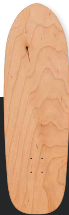
MB428 9.85" x 32"