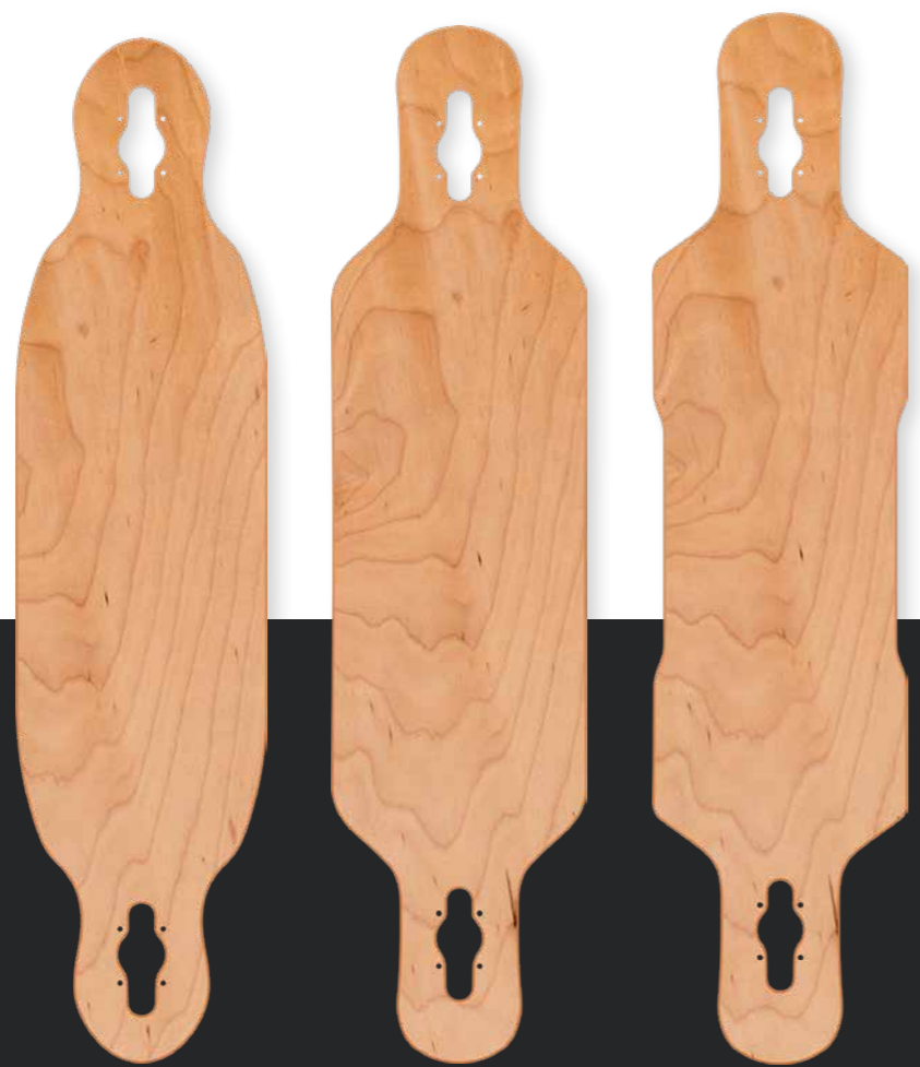
MB101 9.5" x 39.37"