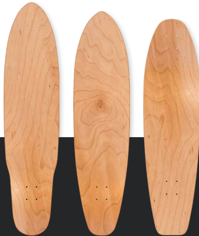
M0760 9" x 38.85"