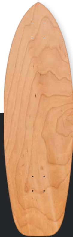
MB456 10" x 33.5"