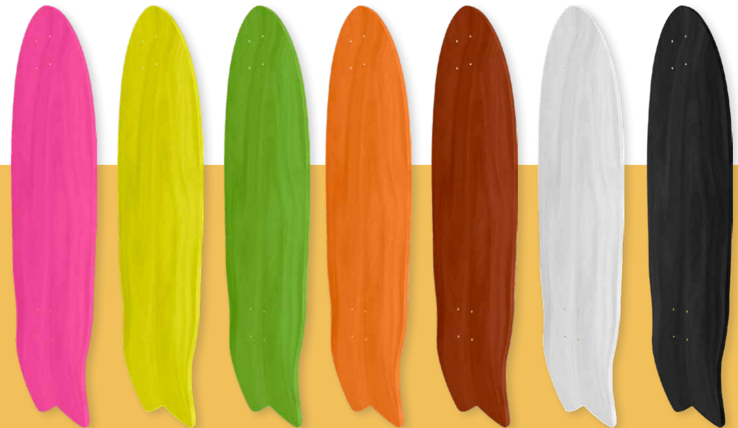
63847 PINK M04IRU00000-2 63844 YELLOW M04IRU00000-1 64846 GREEN M04IRU00000-4 63845 ORANGE M04IRU00000-3 33912 BROWN M04IRU00000-8 62636 WHITE M04IRU00000-5 36242 BLACK M04IRU00000-6