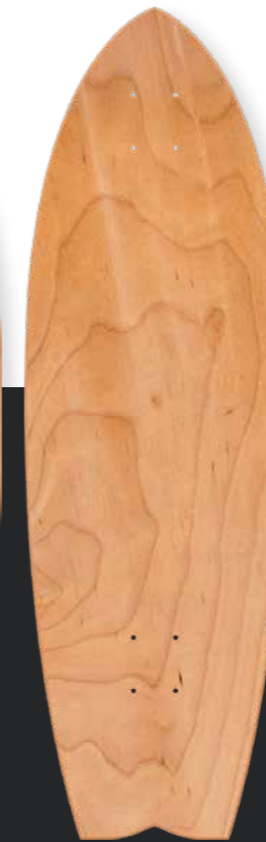
MB449 10" x 32.5"