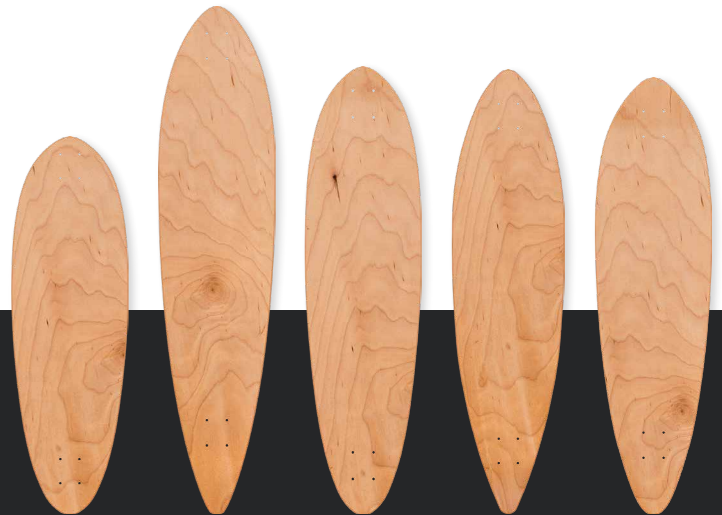
M0910 10" x 32.75"