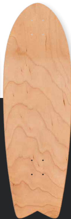
MB409 10" x 31.5"