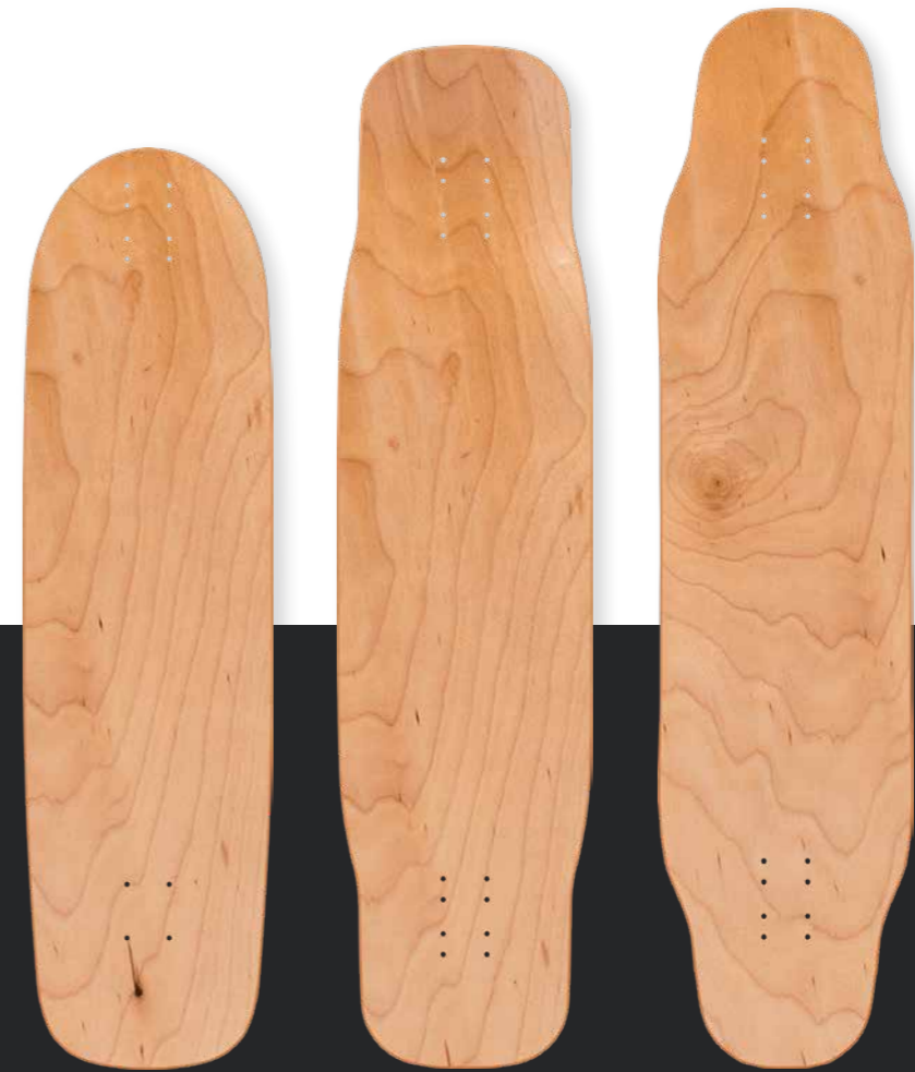
MB701 9.6" x 35.8"