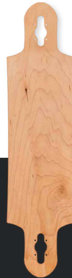
MB104 9.75" x 39.8"