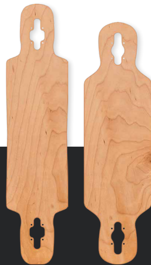
MB136 9" x 36.5"