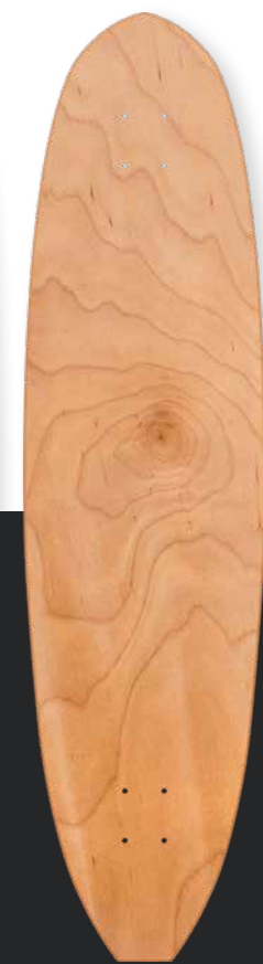
MB928 10" x 40"