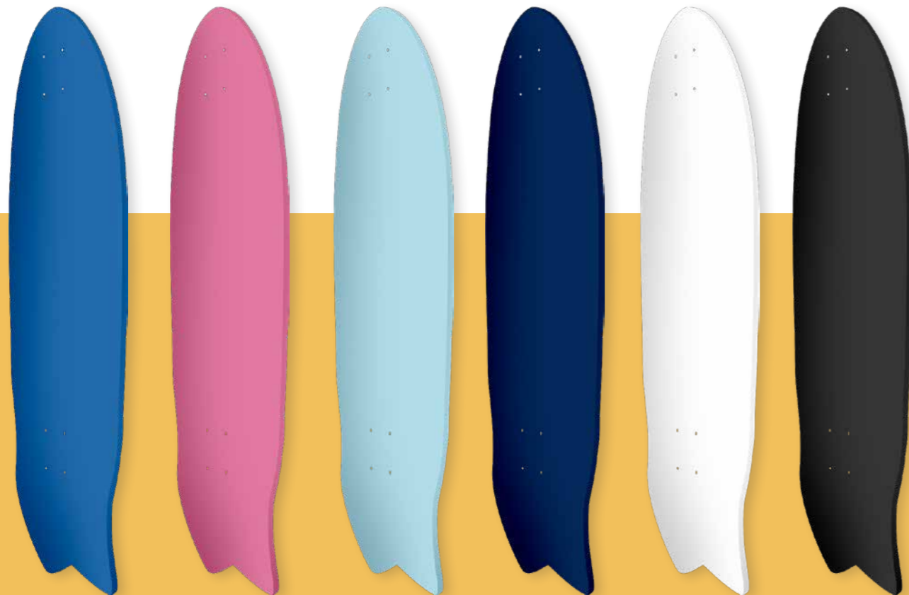
9054 BLUE M04PPIG00000-5 9117 PINK M04PPIG00000-9 9108 TURQUOISE M04PPIG00000-6 R5003 NAVY M04PPIG00000-8 9700 WHITE M04PPIG00000-1 9771 BLACK M04PPIG00000-2