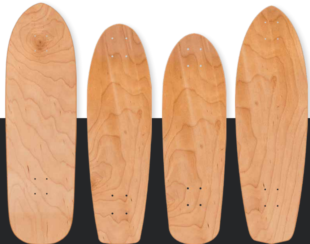
MB603 9.85" x 34"