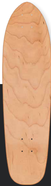
MB401 8.25" x 31.22"