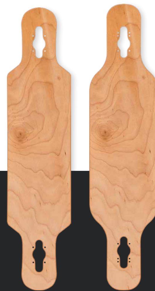
MB201 8.75" x 38.9"