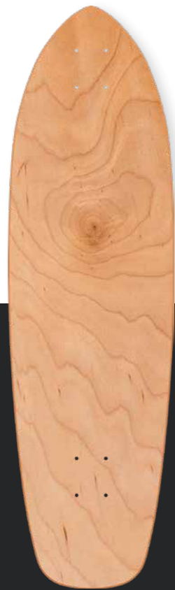
MB469 9.25" x 33"