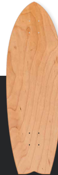
MB448 9.75" x 30.5"